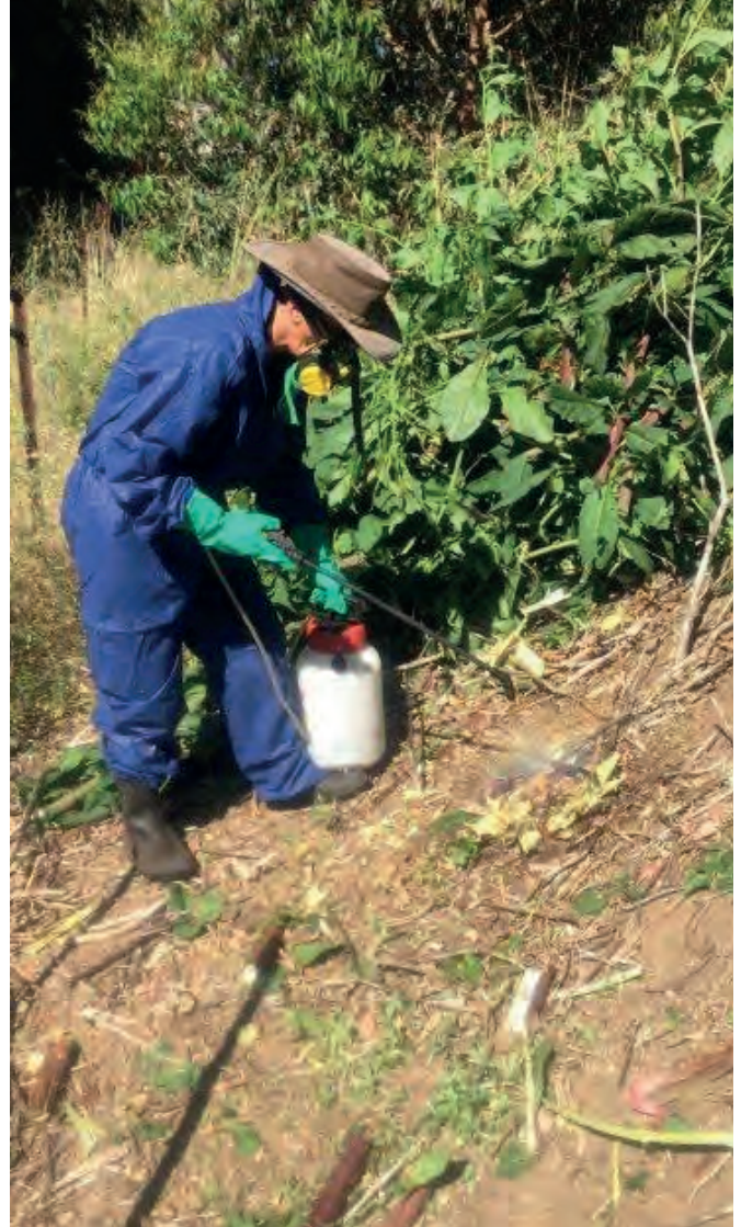
DPIRD Biosecurity Officer spraying the root crown after removal of stems and leaves.

An alternate is to cut stump to below the ground surface, removing the root crown and thoroughly soaking with the herbicide.