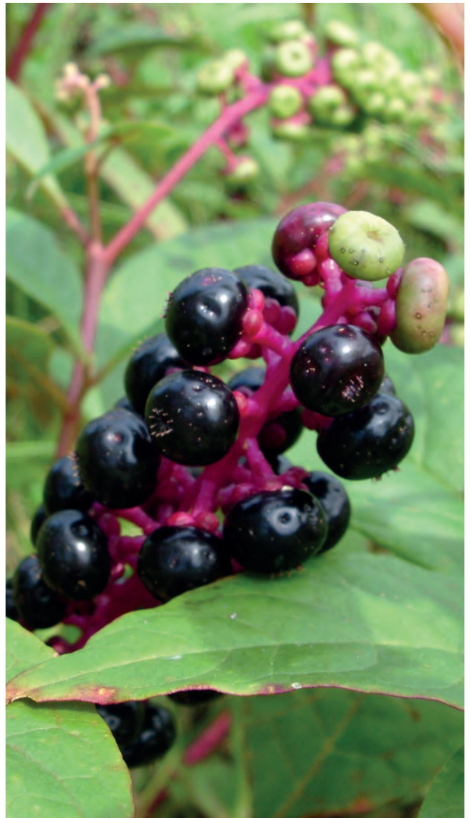
Pokeweed berries.