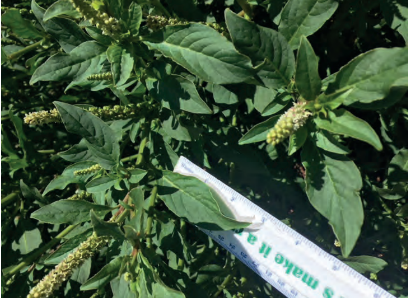
Inkweed flowers and leaves.