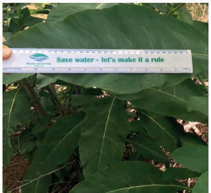
Pokeweed has large elliptical leaves up to 40cm long.