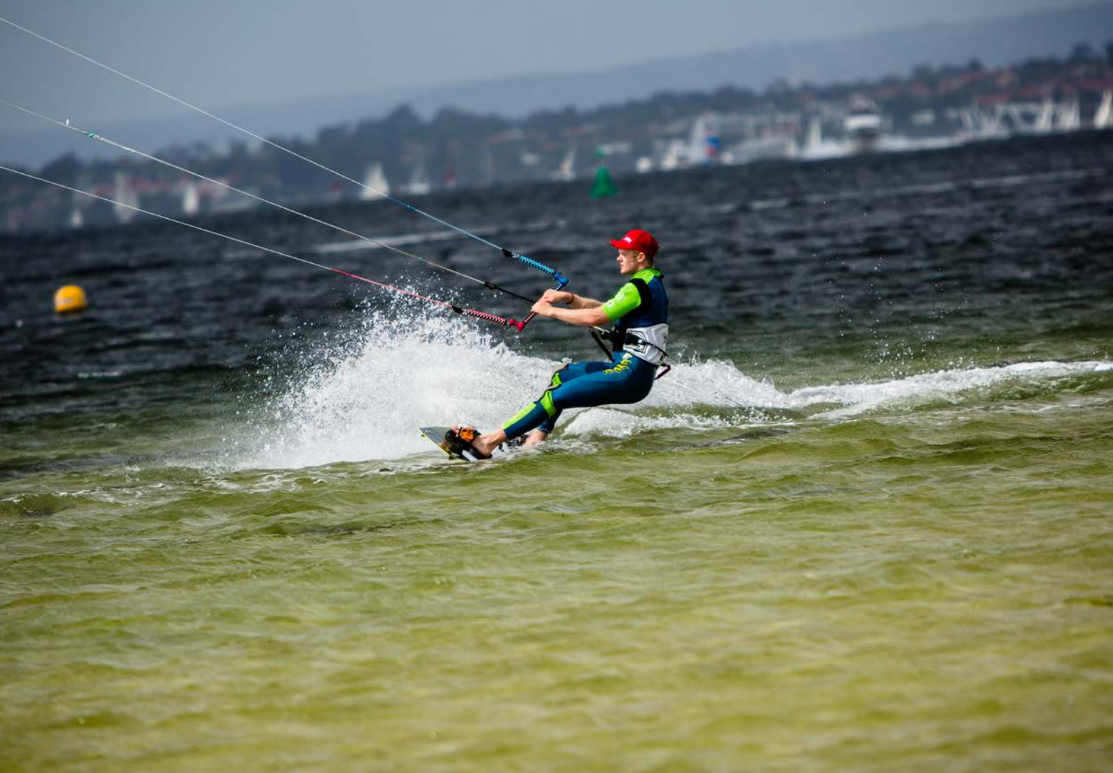
Above Kitesurfing is one of the Riverpark’s fastest growing water sports.