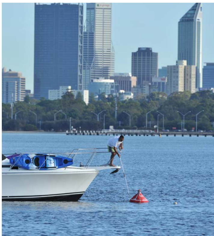
Above A courtesy mooring in the Swan Canning Riverpark.