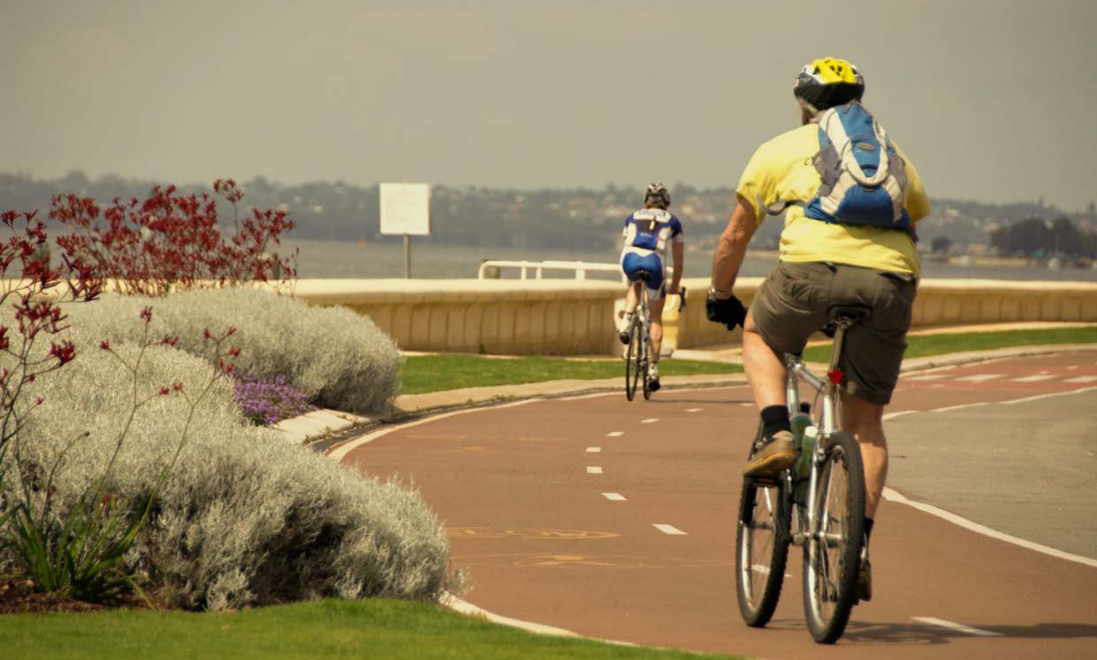
Above An extensive network of cycling and pedestrian paths is available around the rivers.