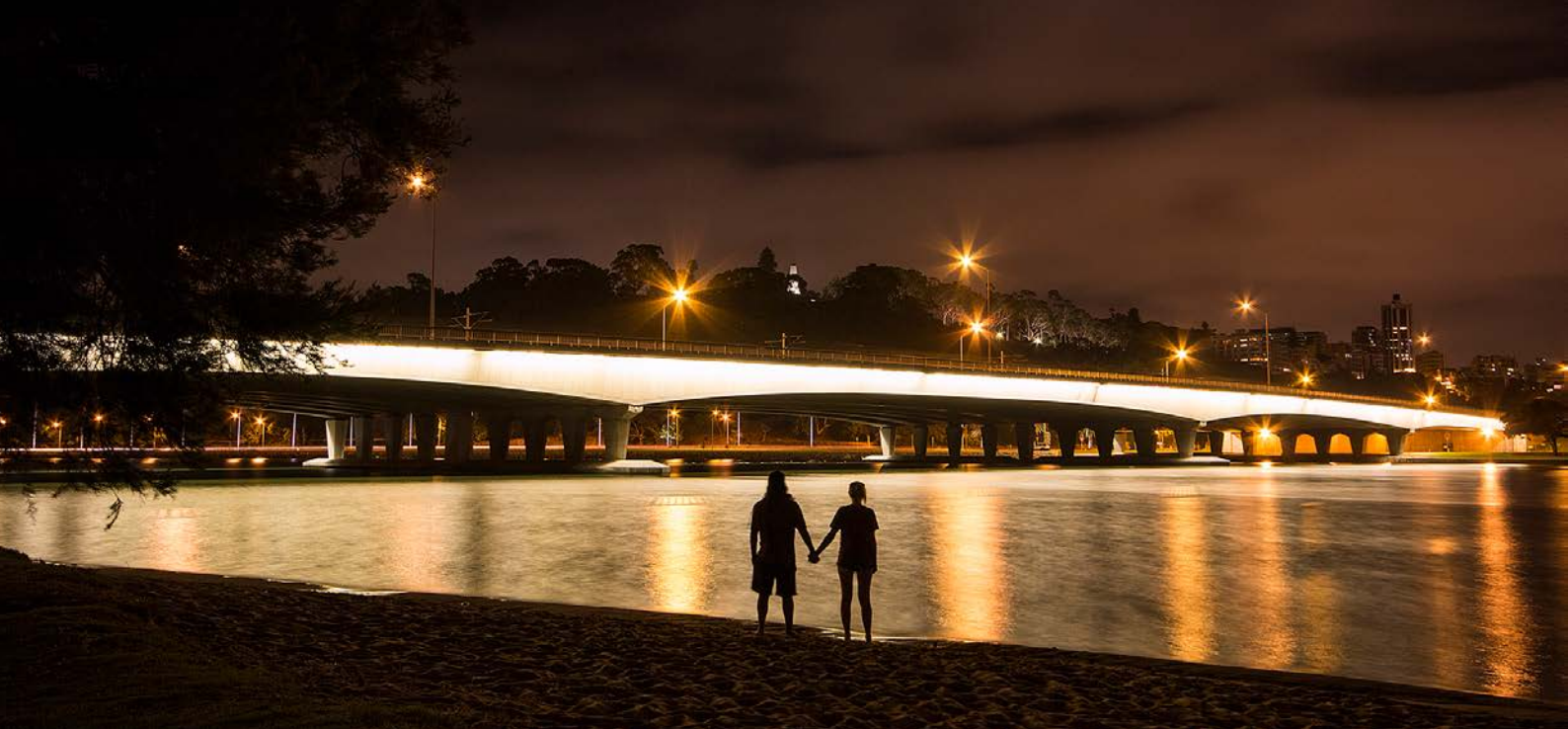
Above The Narrows Bridge.