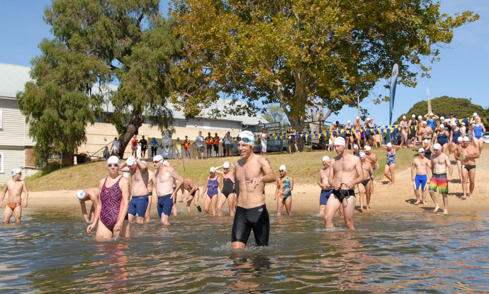
Above Swim Thru 2015 competitors enter the water at Matilda Bay.