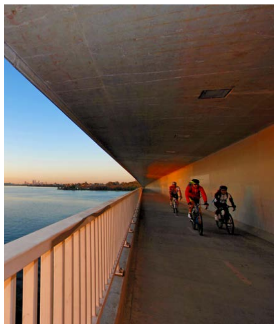
Above Cycling along the Windan Bridge.