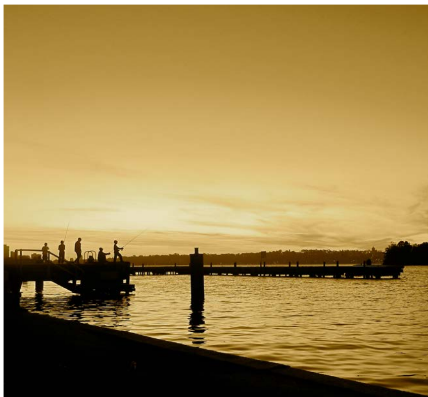
Above Riverpark life.