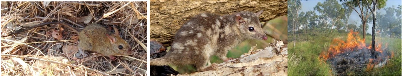
Brush tailed rabbit rat, northern quoll, low intensity hand burning in humid months.

Present reported declines in threatened mammals across northern Australia's tropical savannas has implications for the Kimberley which is the last mainland area with an intact suite of these mammals. Very frequent (occurring every 1-3 years) and extensive (>1,000 km 2 ) wildfires have been implicated in these declines, with approximately 35 percent of savannas burnt annually. In 2003, the department initiated fire ecology research and monitoring in the Kimberley. This work included repeated mammal trapping and vegetation surveys across savanna habitats, and different tenure and land management types.