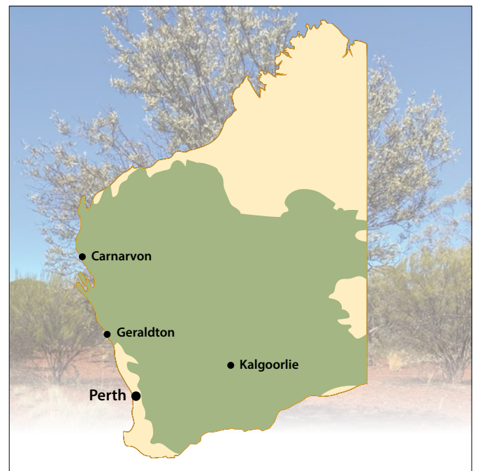
Wild sandalwood distribution in Western Australia.

It is vital to understand rates of population increase or decline and the occurrence and patterns of recruitment as this information helps to shape management approaches to meet requirements of the Sandalwood Biodiversity Management Programme . In particular, information can be used to provide further guidance on sustainability factors essential for species conservation.