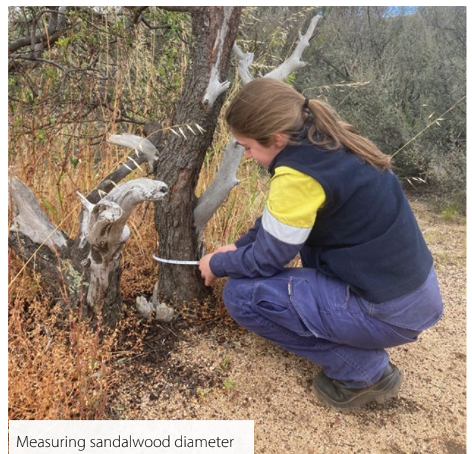
Measuring sandalwood diameter