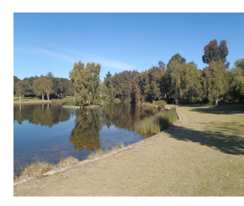
Artificial lakes like this one at Piney Lakes Reserve (Melville) will likely play a role in the survival of urban dragonflies in the long-term. However, with few emergent plants and mostly exotic fringing vegetation, careful planning and revegetation could enhance their value as dragonfly habitats.

Perth's urban natural wetlands are becoming dry more frequently and for longer periods, raising concerns for the survival of freshwater species. Dragonflies with short nymph stages (like the tau emerald, Hemicordulia tau) can adapt to these changes by undergoing eclosion before or during wetland drying, therefore spending the dry period as adults or as eggs in the sediment. However, species with longer nymph stages may become restricted to wetlands with more permanent water as they cannot accelerate their development to reach adulthood in short periods of inundation. Our research indicates that at least some of those species will be driven to rely on created or highly modified urban wetlands, rather than drying natural wetlands, as they contain water year-round. As native species increasingly rely on modified urban wetlands, revegetating these areas with aquatic, fringing, and terrestrial plants to support each life stage may be valuable for long term dragonfly conservation in Perth's urban areas.