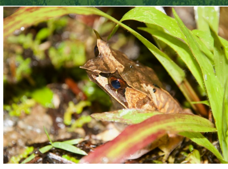
Posting photos of unusual or rare animals can cause unintended harm. For example, photos of this long-nosed horned frog (Pelobatrachus nasutus) can encourage more people to search for it, raising the chance of inadvertently spreading the frog-killing chytrid fungus.