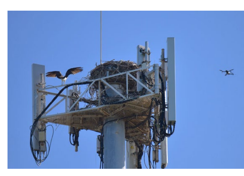
Drones can cause distress to birds, like this drone hovering above an osprey nest in Mindarie, Western Australia.