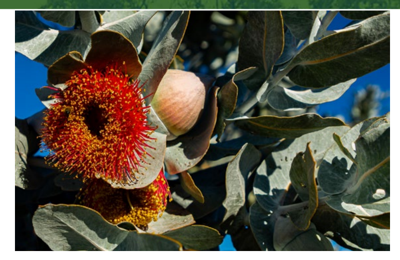
Eucalyptus macrocarpa getting ready to set seed in the Wildflower Society of WA York Branch's seed orchard.

The seed orchard's potential is, as yet, largely untapped. It contains over 60 species including Acacia , Alyogyne , Banksia , Callistemon , Calothamnus , Eucalyptus , Hakea , Leptospermum , Melaleuca and Viminaria . Carnaby's cockatoos have visited for the first time this spring, feasting on the fruit of Hakea petiolaris , and our branch harvests seed for our annual propagation programme. However, we would like to link into other groups desiring local provenance seed, to make some return on the time and effort we invest. We would also like to hear how other groups operating a similar project, have achieved some sustainability.