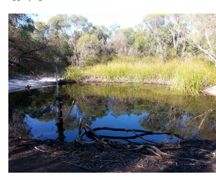
Emergent plants like this stand of jointed rushes (Machaerina articulata) at Chelodina wetland (within the Beeliar wetlands) is a prime example of vegetation used by urban dragonfly species.

Our results showed seasonal differences in relationships between adult dragonflies and their habitat that suggest why urban bushland is important. In spring, the most important factors for dragonflies were water temperature (whether it was above or below 20°C) and the cover of lake edges by emergent aquatic plants. In this season mating is occurring and emergent plants provide perching locations for adults to rest, as well as sites for both egg-laying and eclosion.