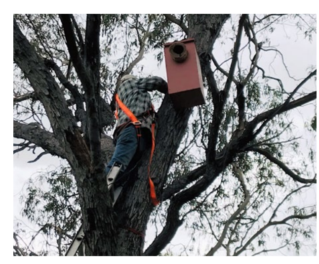
A variety of nest boxes have been installed in York to complement the revegetation plantings. This box is large enough to host boobook owls, ringneck parrots, galahs and brushtail possums.