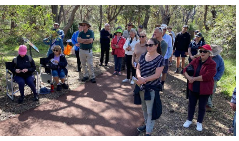
At the trail head of the <u>Jarrah Trail self-guided walk</u>. The path is sealed, allowing for access and mobility for all. There are 20 points of interest which use QR codes to link to more information and four interpretive signs. Spot the sign to the left of this photo.

This spectacular piece of urban bushland is one of the City of Joondalup's five major conservation areas due to its high biodiversity values, ecological connectivity and regional, national and international significance. It covers 60ha and is a great place to reconnect with nature with three walking trails to explore (Jarrah, Banksia and Tuart trails), and lots of quiet places to sit and relax.