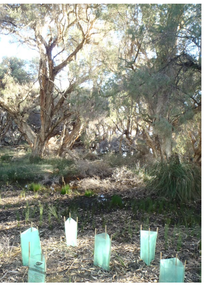
Fringing swamp paperbark trees (Melaleuca rhaphiophylla) and revegetated understorey at Manning Lake (within the Beeliar wetlands) provide shade and cooling to support dragonflies, as well as refuge from predators.

Emergent vegetation also provides protection from predators like birds. In summer however, the most important factors changed to the amount of surrounding native terrestrial vegetation and the distance to the nearest patch of native vegetation or wetland. This reflects the need for adults to move around urban landscapes to seek prey, mates and breeding habitat. In our climate of hot summers and autumns, access to markedly cooler air beneath fringing trees may help to prevent overheating or desiccation of adults. So, as well as providing areas for hunting and protection from predators, urban bushland likely plays an important role by providing shade to adults in the heat of summer and autumn.