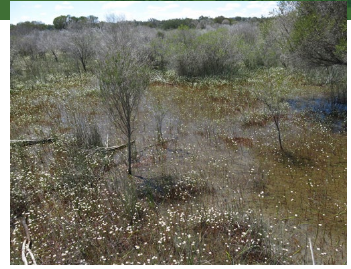
The seasonal claybased wetlands at Wandoo National Park transform into a riot of ephemeral herbs as the waters dry out in spring. The moist soils are also easily damaged by off-road vehicles.

And for the last 12 months, Track Care have been conducting regular survey and maintenance of tracks within the park. The work involved included the use of petrol and electric chainsaws to clear fallen trees off tracks, rubbish collection and the identification of car wrecks and hazardous waste for future removal. With almost 2000 working hours and more than 349 trees removed from tracks, the project has proven to be an immense success, ensuring visitors to the Wandoo National Park can travel along the maintained tracks safely.