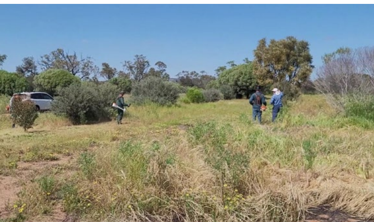
It turns out that keeping on top of weeds in the seed orchard is more than a two person job!

York Branch of Wildflower Society of Western Australia email <a href="mailto:Kboladeras@gmail.com">Kboladeras@gmail.com</a>