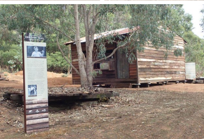
Jack's shack prior to maintenance done by Track Care volunteers and Friends of Donnelly Village (above left)), during relocation and the rebuild (above right), and after completion (below).