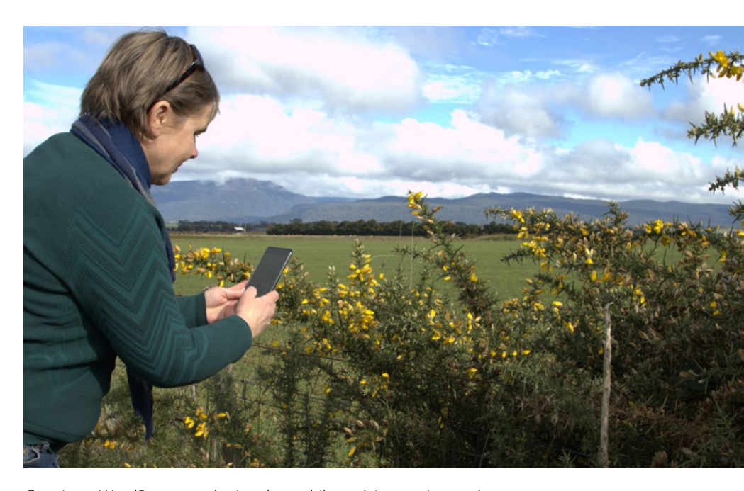
Creating a WeedScan record using the mobile app's interactive mode.

WeedScan is supported by the <u>Centre for Invasive Species Solutions</u>, Australia's national science agency – <u>CSIRO</u>, the NSW <u>Department of Primary Industries and Regional Development</u> and the South Australian, Queensland and Victorian Governments. It was funded by the Australian Government's <u>National Landcare Program</u>.