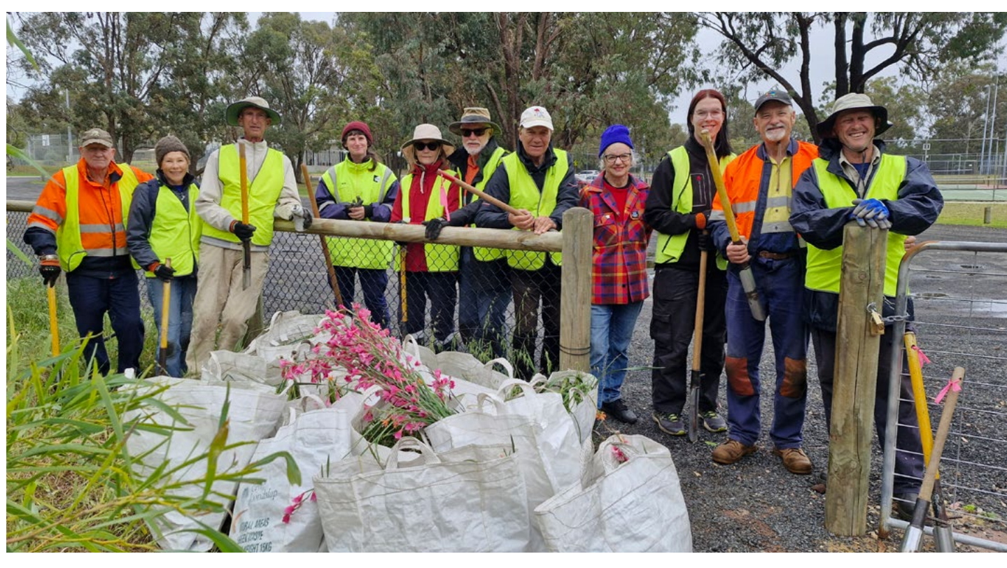
Friends of Sorrento Beach & Marmion Foreshore volunteers decided to take a week's break from the coast to help our friends at Warwick Bushland remove the bulbous weeds cape tulip and gladiolus at Warwick Bushland using our own half-pipe levering tools (right foreground).

Friends of Sorrento Beach & Marmion Foreshore volunteers decided to take a week's break from the coast to help our friends at Warwick Bushland remove the bulbous weeds cape tulip and gladiolus at Warwick Bushland using our own half-pipe levering tools that we routinely use on the coast to lever out dune onion weed by the thousands. This tool, being very narrow, can quickly lever out many weed species with very little soil disturbance. It is important to do this task at this time of year as both these weed species are flowering, making them easy to spot, and before they have shed their seed. These weed species, originating from South Africa, have the ability to invade bushland in good condition and can be found right through Kings Park and in most natural areas of the south-west of Western Australia. The volunteers of Friends of Sorrento Beach & Marmion Foreshore fortunately eliminated those two weed species from Marmion a few years ago, but we need to keep out an eagle eye to ensure there none left there to try and make a comeback!