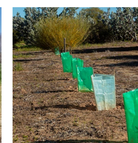
New planting at the seed orchard this year, with the grey branches of established Eucalyptus macrocarpa in the background.