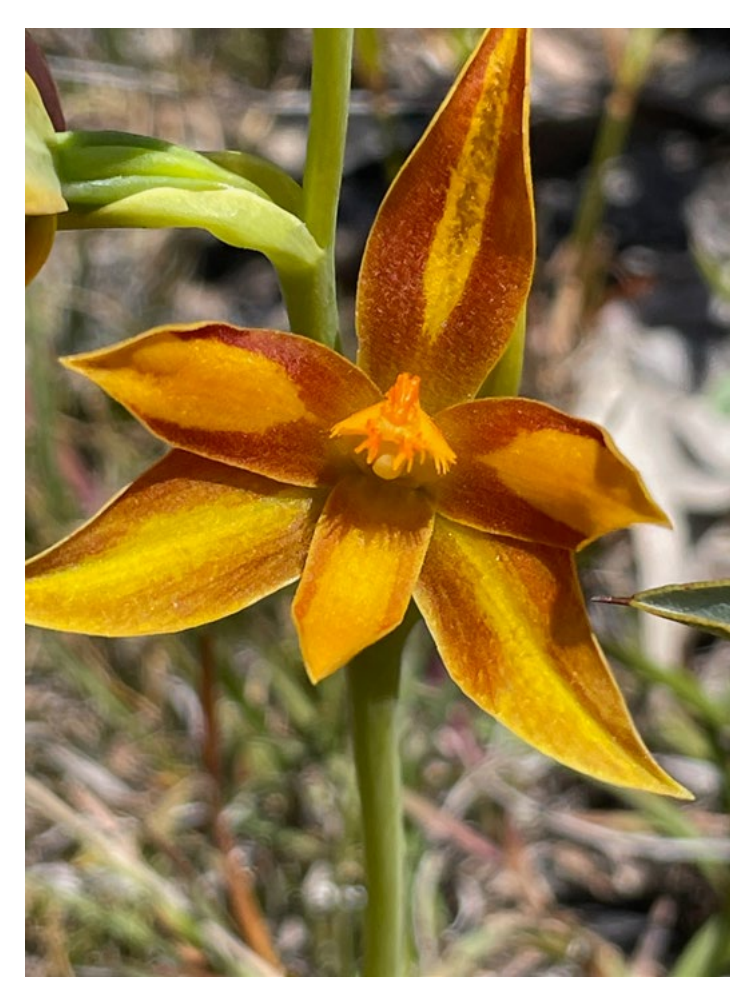
Attractive and rare orchids such as the York sun orchid (Thelymitra yorkensis) are a magnet for photographers and social media postings which can put them at risk.

It's very easy for birdwatchers and photographers to misuse this power by using bird ID apps and a speaker to draw out rare species. It might seem harmless but drawing shy woodland birds out into the open risks predation, or can entice a mother off her nest. Playing calls can also make birds aggressive, change important behaviours, or disrupt their breeding.