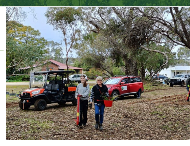
Community planting days look to provide a substantial understory that creates food and protection for the range of animals that use these pocket-sized wildlife havens in York.

River Conservation Society email chair@riverconservationsociety.org