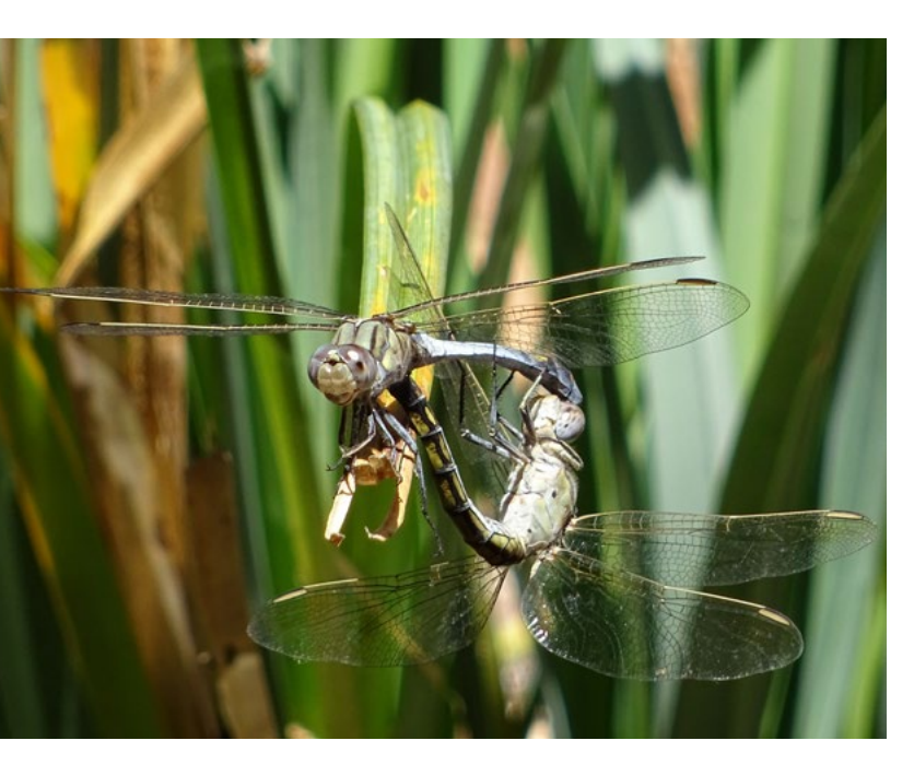
Blue skimmer dragonflies (Orthetrum caledonicum) attached to each other and perched on vegetation during mating. The upper dragonfly is male, the lower female.

Dragonflies are among the most eye-catching insects in our urban bushland, glistening as they dart around our lakes and wetland. South-western Australia is home to more than 40 species, many of which are unique to the region. At least 15 dragonfly species are commonly seen in Perth's urban wetlands, but their survival here may be at risk as our climate grows hotter and drier. New research is revealing just how much these vibrant insects rely on both aquatic and bushland habitats—and what they'll need to thrive in the future.