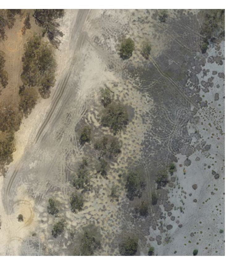
Drone footage taken by Track Care show the proliferation of vehicle tracks in the soft clay soils of the wetlands.

Track Care has been involved in helping to preserve the natural values at Wandoo National Park, an hour east of the Perth metro area, for almost a decade. The park is named after its wandoo woodlands but it also contains a diversity of habitats including jarrah and marri woodlands, heathlands, granite outcrops and seasonal wetlands. One area of concern was serious damage and the proliferation of tracks by off-road vehicles in the seasonal clay-based wetlands.