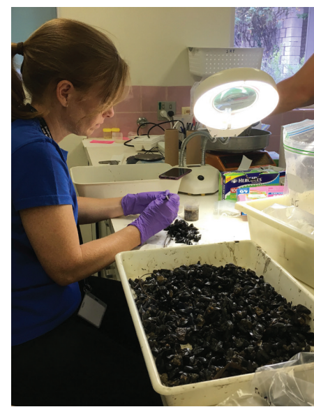
Above Toxicity assessments were undertaken on mussels, crabs, and fish from the Riverpark.

Below The head, guts and gills of crabs collected from the river should be removed before consumption.