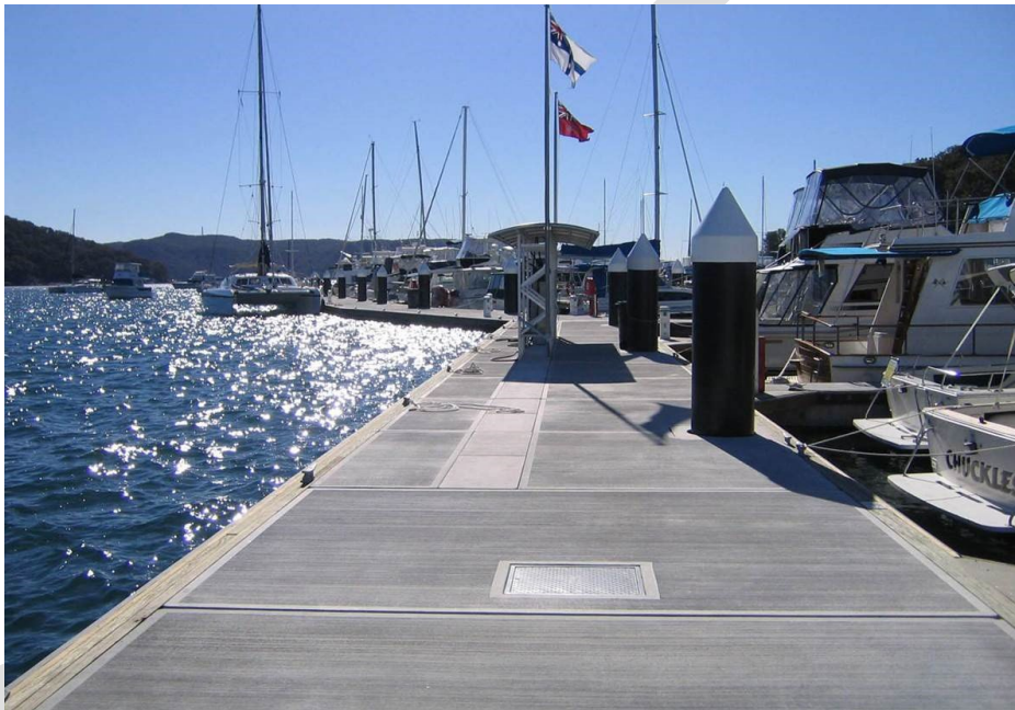
Figure 6: Similar structure and materials to proposed jetty 5