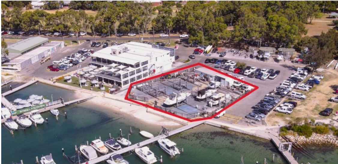
Figure 3: Aerial image showing location of the slipway