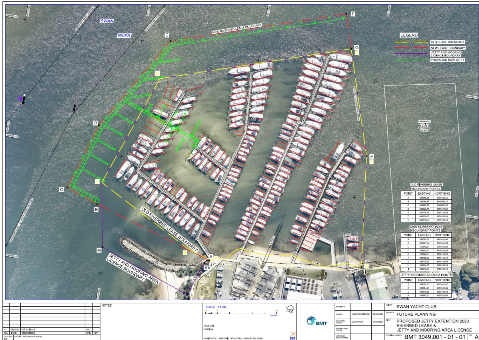
Drawing BMT43049-001-01-01 Rev A - showing proposed jetty 5 and proposed lease boundary