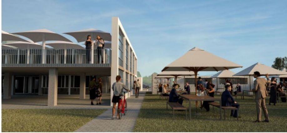
Figure 5: Mock up of event space over former slipway