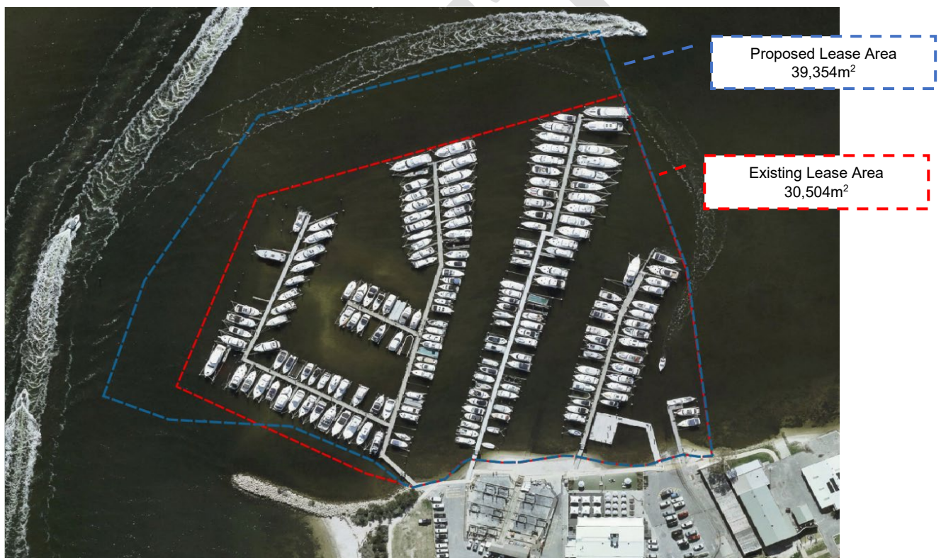
Figure 7: Site showing Proposed and Existing River Reserve lease