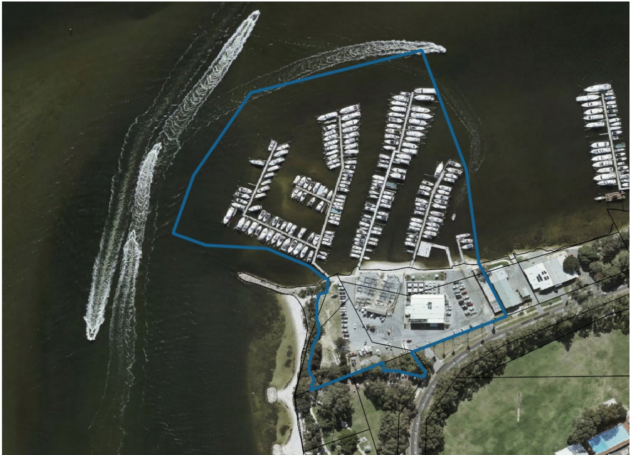
Figure 1: Application area for Proposed Development showing proposed increased River reserve lease area