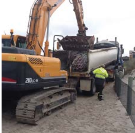
Placing the secured carcass in a truck for disposal.