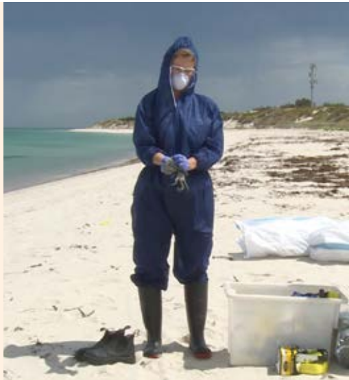
PPE should be worn when handling biological materials..