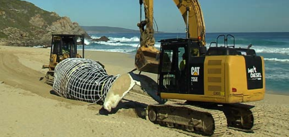
Secured whale carcass being dragged along the beach.