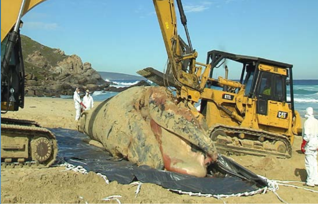
Moving the whale onto the net array.