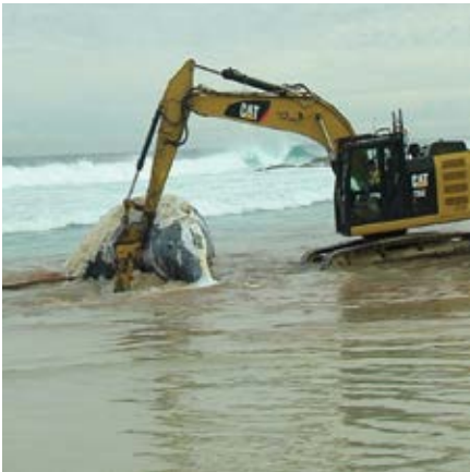
Beach side before securing the whale carcass.

attachment on the bulldozer provides a lifting point for transport along the beach. A large crane is recommended. Dual lifts with multiple cranes may also be considered. In seeking an appropriate crane, review your exit (lifting location) and ask the crane provider their advice on weight verses distance from the craning point. Carcasses up to 12m (around 26 tonnes) can be transported in a semi-tipper truck. Larger animals should be floated on a low loader. Alternatively you can apply to the Department of Transport for an overweight load permit. Loads of up to 45 tonnes can be transported by mining equipment under permit.