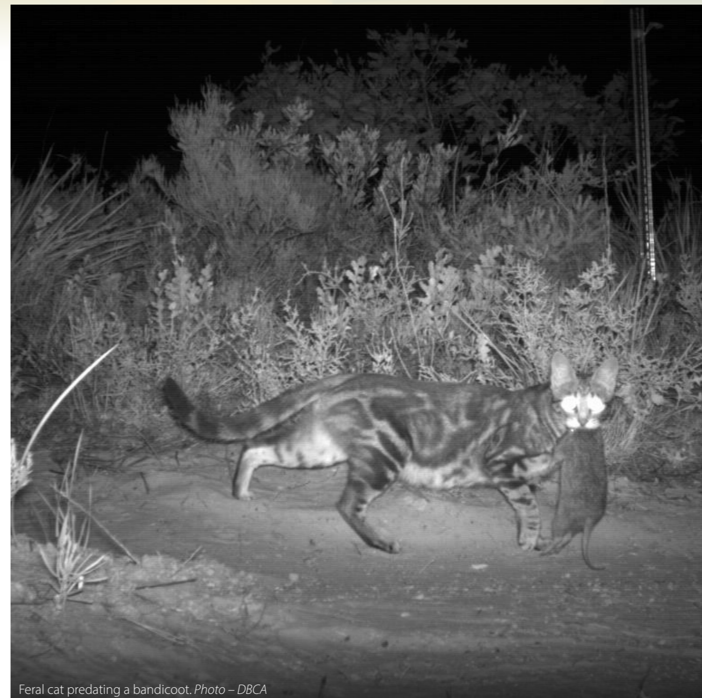
Feral cat predating a bandicoot. Photo – DBCA

Back cover Feral cat predating native species.. Photo – DBCA.