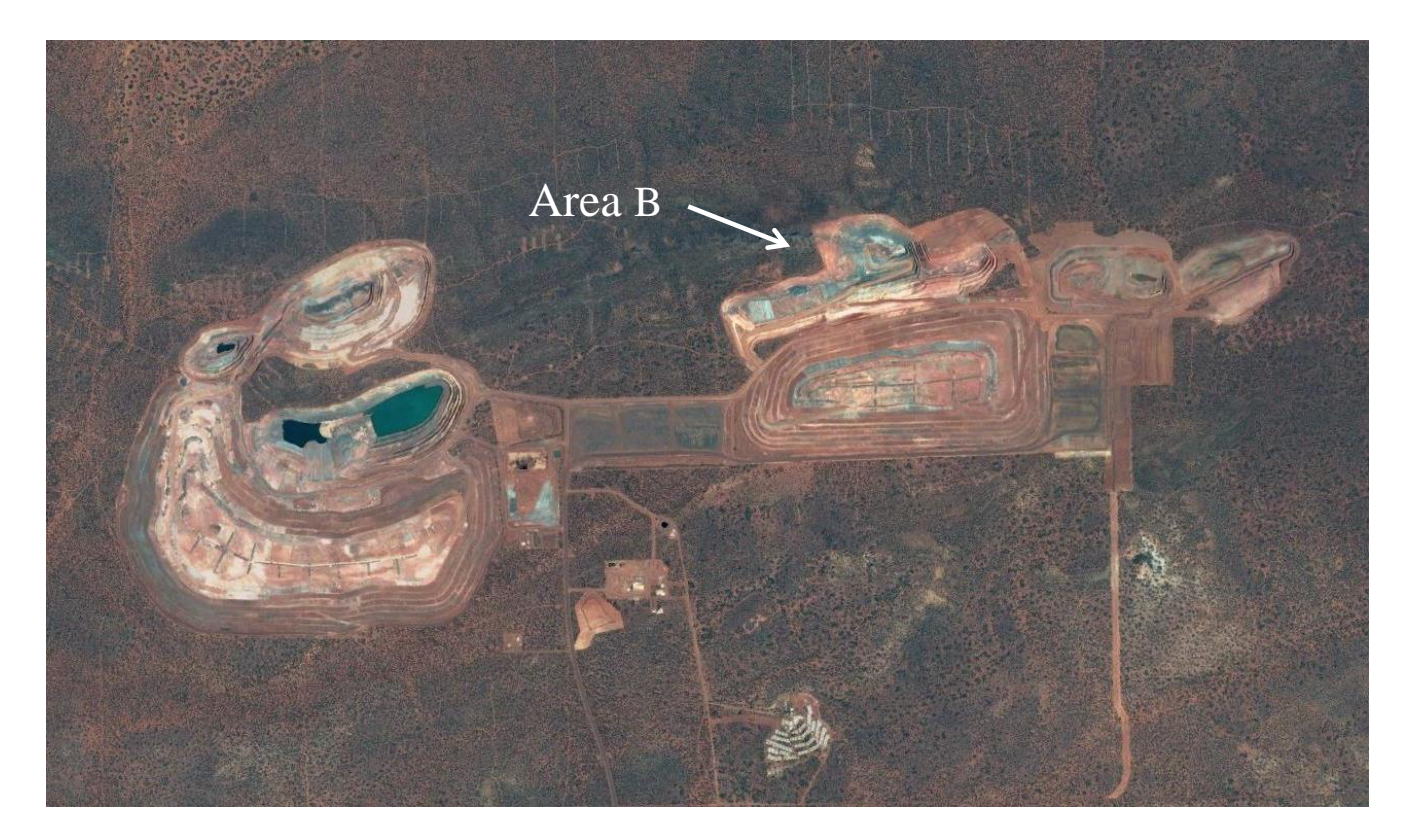
Figure 1: Aerial photo of Windarling Range and mine showing the location of Area B

Land Management Act 1984. On this basis the EPA recommended that the direct requirement for the proponent to take action to reserve areas where the species occurs be removed and condition be reworded to include "measures to support the secure conservation tenure for the remaining population of T. paynterae subsp. paynterae ", subject to seeking access to Area B. Seven Ministerial Statement approvals (627, 802, 843, 874, 900, 907 and 909) applying to the Yilgarn operations were issued between 2003 and 2012. These statements have been consolidated into a single Ministerial Statement (Statement #982) which was published on the 24<sup>th</sup> September 2014. Under Statement #982, in relation to the T. paynterae subsp. paynterae , the proponent (Cliffs) are required to prepare and implement a Research and Management Plan and Recovery Plan if the proponent intended to apply for access to Area B for ground disturbing activity. The Research and Management Plan is to include monitoring of numbers of individuals, health, viability and reproductive success, ecological research and potential translocation, pollination vectors, management, and measures to support the secure conservation tenure.