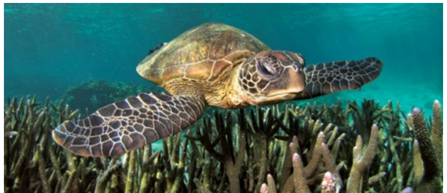
Top left: Indo-Pacific bottlenose dolphins. Photo – Holly Raudino/DBCA Top right: Wedge-tailed shearwater. Photo – Grant Griffin/DBCA Above left: Great knot. Photo – Grant Griffin/DBCA Above right: Green turtle. Photo – Johnny Gaskell