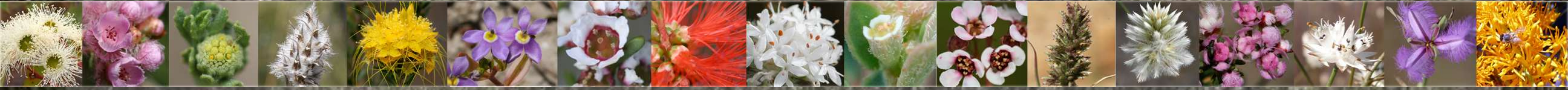
Schoenolaena juncea Family: Apiaceae