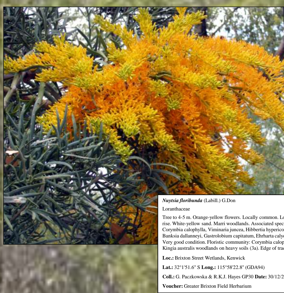
Nuytsia floribunda (Labié) G.Don Loranthaceae Tree to 4-5 m. Orange-yellow flowers. Locally common. Low sandy soil. White yellow sand. Mann woodlands. Associated species: Corymbia calophylla, Viminaria juncea, Hibiscus bopodensis, Hibiscus dilatatus, Gammahortia capillaris, Elaeocharis cylindrica. Very good condition. Floristic community: Corymbia calophylla-Kinga mallee woodlands in heavy soils (S). Edge of track. Loc: Brixton Street Wetlands, Kennick Coll: G. Paczkowska & H.K.J. Hayes GP50 Date: 30/12/2008 Voucher: Greater Brixton Field Herbarium