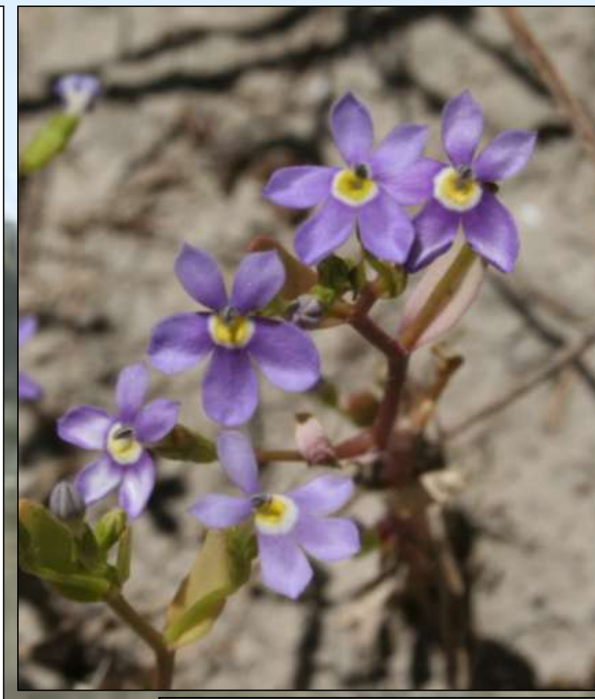
Isotoma pusilla Benth. Campanulaceae Erect stem to 5 cm high and 2 cm wide. Flowers white-purple. Abundant. Water inundated claypan. Brown clay. Melaleuca lateritia shrubland Amphibromus grassland. Associated species: Melaleuca lateritia, Amphibromus nervosus, Acaia affinis, Melibolus sp., Eucalyptus condition. Floristic community: both rich shrublands in claypan (S). Loc: Brixton Street Wetlands, Kennick Coll: K.L. Brown & G. Paczkowska KL8684 Date: 27/11/2007 Voucher: Greater Brixton Field Herbarium