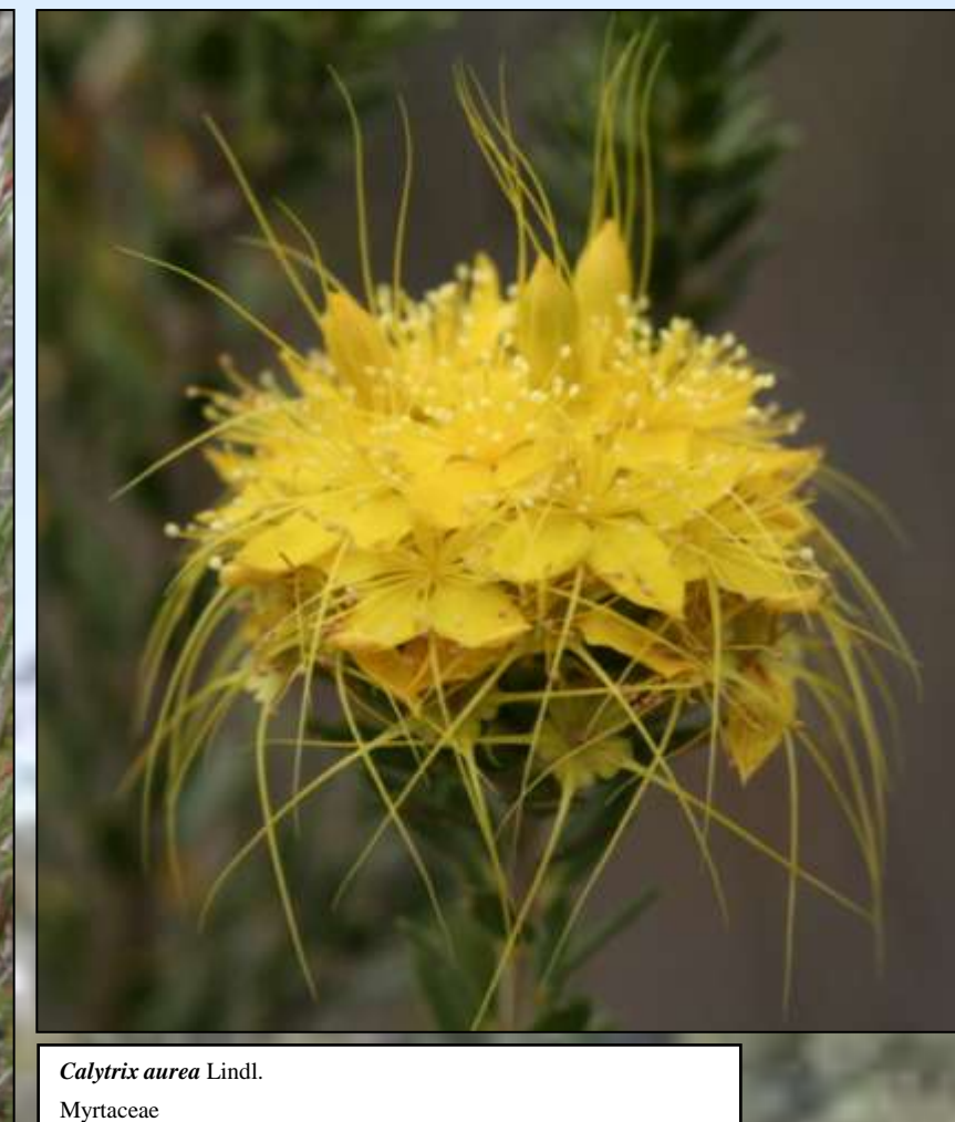
Calytrix aurea Lodd. Myrtaceae Perennial erect compact shrub to 0.7 m high. Flowers yellow. Locally common. Wet flats. Yellow-grey sandy loam. Viminaria juncea tall shrubland. Associated species: Viminaria juncea, Verticordia spp., Keraia micrantha, Hibiscus grandiflorus, H. triflorus, Acaia leucocarpa var. leucocarpa, Hypobryonia angustifolium. Excellent condition. Floristic community: both rich shrublands in claypan (S). Loc: Brixton Street Wetlands, Kennick Coll: K.L. Brown & G. Paczkowska KL8688 Date: 14/12/2007 Voucher: Greater Brixton Field Herbarium