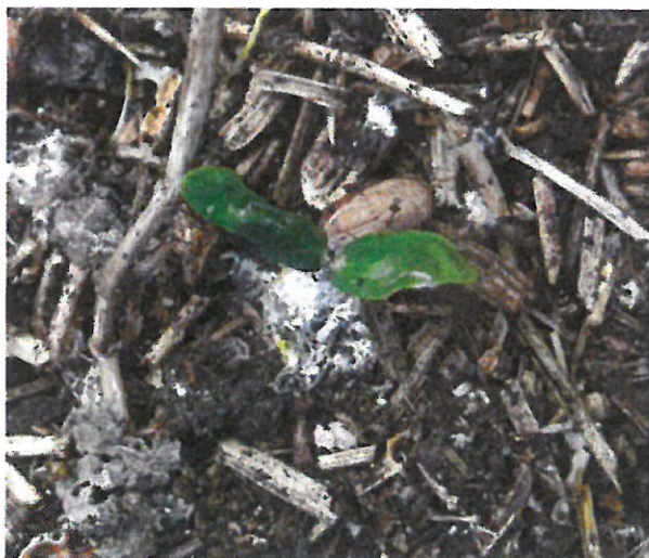
Figure 3. Olive seed germinating in restoration trials, August 2015.

subject to monthly monitoring from March 2015 to December 2015. Throughout the course of the trials large numbers of Silver Gulls were continually perched on the weld mesh cages, voiding Olive seed into our restoration trials and providing an opportunity to observe the fate of Olive seed brought onto the