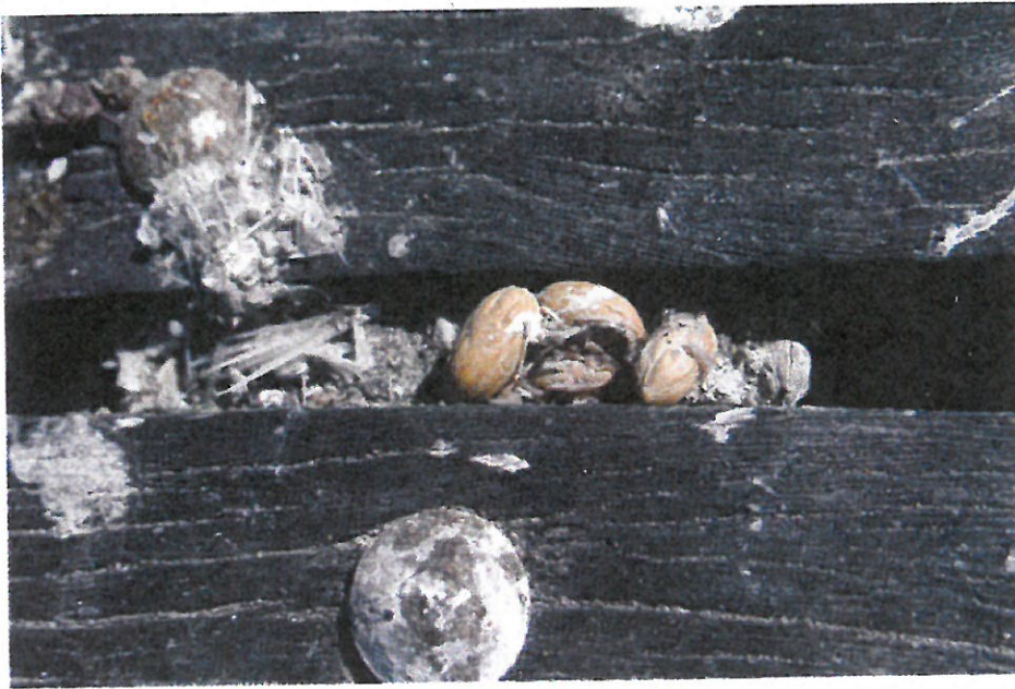
Figure 1. Olive seed on the boardwalk at Penguin Island.

nature of the species in southern Australia and the impacts Olives can have on biodiversity (Spennemann and Allen 2000; Crossman 2002).