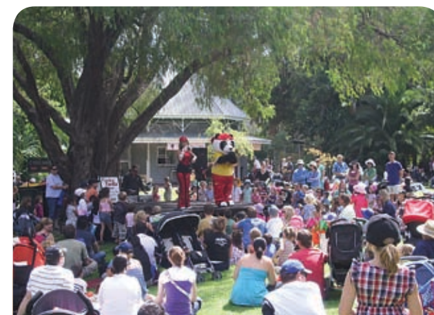
The Teddy Bears' Picnic on 29 March 2009.

Ending the summer season, Perth Zoo hosted a Teddy Bears' Picnic as a celebration of the first birthday of Perth Zoo's Sun Bear cub, Maly. Held in collaboration with Free The Bears Fund, it was a resounding success and attracted 6,261 visitors. The event also raised awareness and funds for Sun Bear conservation.