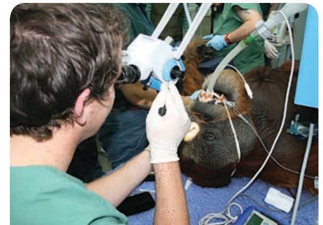
Male Sumatran Orangutan, Hsing Hsing, undergoing surgery.

The two human eye specialists, who donated their time and expertise, found that Hsing Hsing had glaucoma in his right eye, which was unrelated to his diabetes, and had lost up to 98 per cent of vision in that eye. With no way of restoring the sight, the eye was removed to