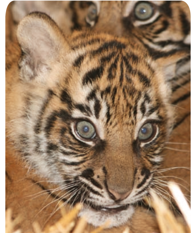
Sumatran Tiger cub.

A Senior Managers group including the Chief Executive Officer, directors, curators and sectional managers meets fortnightly to discuss operational matters and provide updates on corporate executive and board meeting outcomes and section activities. Other standing committees include the Occupational Safety and Health Committee, the Disability Services Committee, the IT Planning Committee and the Risk Management Committee. Special project groups are established as required to coordinate and oversee specific breeding programs or capital works projects.