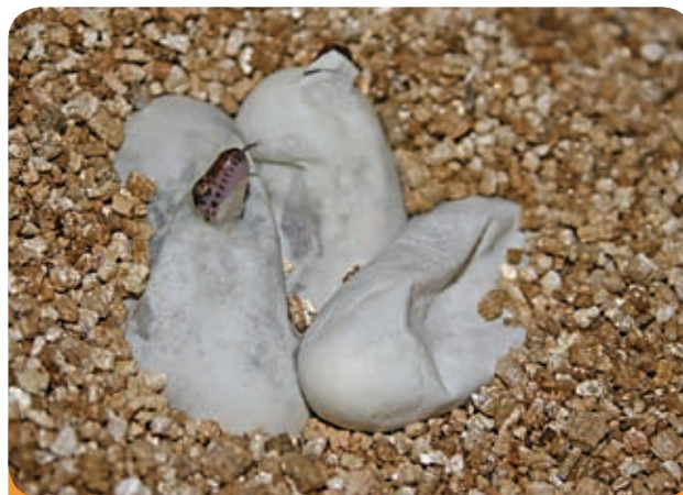
Pygmy Python hatchlings.

The Little Penguin colony has successfully bred seven chicks and raised them to adulthood. The penguins were paired again in June 2009 with some pairs already incubating eggs. With the aid of nest box cameras and temperature recording equipment, Perth Zoo is undertaking a research project on penguin reproduction and behaviour.