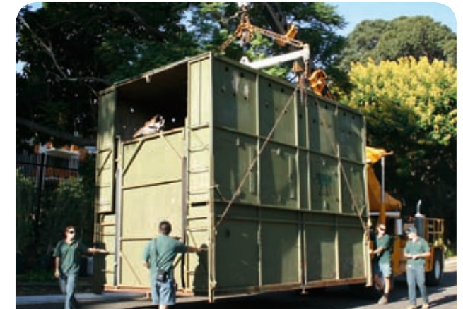
Female giraffe, Mapenzi, leaving Perth Zoo for Australia Zoo.

The redeveloped elephant exhibit was opened in January 2009. The exhibit has now trebled in size and includes a new training yard area and bull barn facility for the exclusive use of the bull elephant. Large scratching posts have also been installed in all exhibits to allow keepers to suspend enrichment and food items and as rubbing poles for the elephants. The periphery viewing bays and gardens surrounding the bull exhibit were also upgraded.