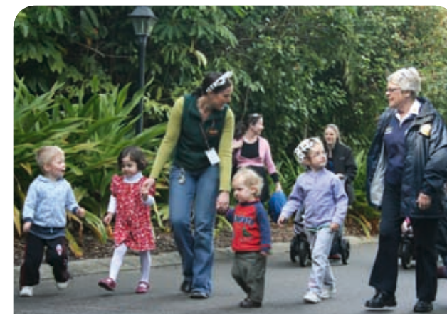
Participants in the 'A to Zoo' education program.