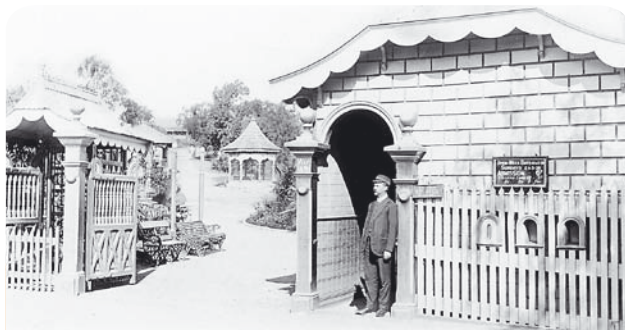
The Perth Zoo entrance in 1901.

Perth Zoo's website continued to be a well-used portal for accessing the Zoo's online resources and received 293,418 visits in 2008-09.