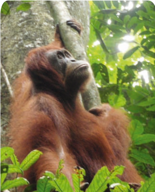
Sumatran Orangutan Temara at Bukit Tigapuluh.

Perth Zoo is one of only six institutions in the world successfully breeding the Silvery Gibbon (or Javan Gibbon). It is a key South-east Asian primate species supported through Perth Zoo's captive breeding, field work with partners and