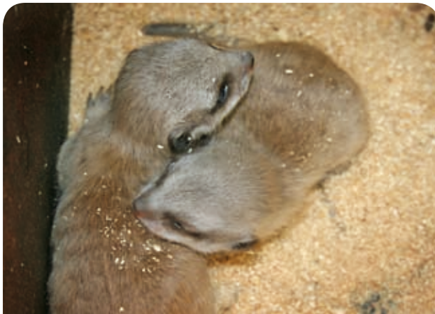
Two of the meerkat kits born in 2008.

In November 2008 the new Slender-tailed Meerkat breeding pair produced three kits. This was the first successful birth of meerkats at