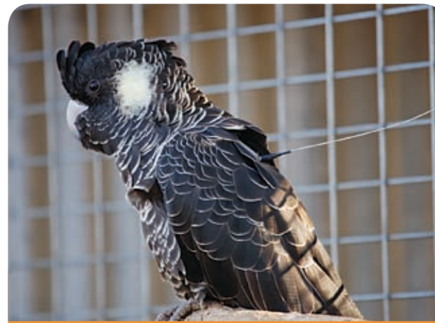
Carnaby's Cockatoo with radio transmitter.