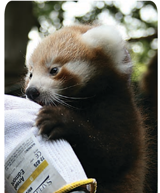
Nepalese Red Panda cub.