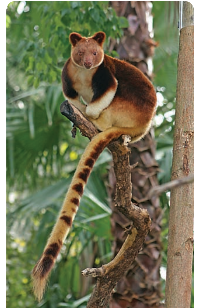
Female Goodfellow's Tree Kangaroo, Tani.

During the year Zoo staff assisted several external agencies with conservation field work, particularly with Western Australian species. Two Australian fauna keepers attended the 'Great Toad Muster' in October 2008. The Muster is an initiative run by non-government organisation, Stop the Toad Foundation. This annual event