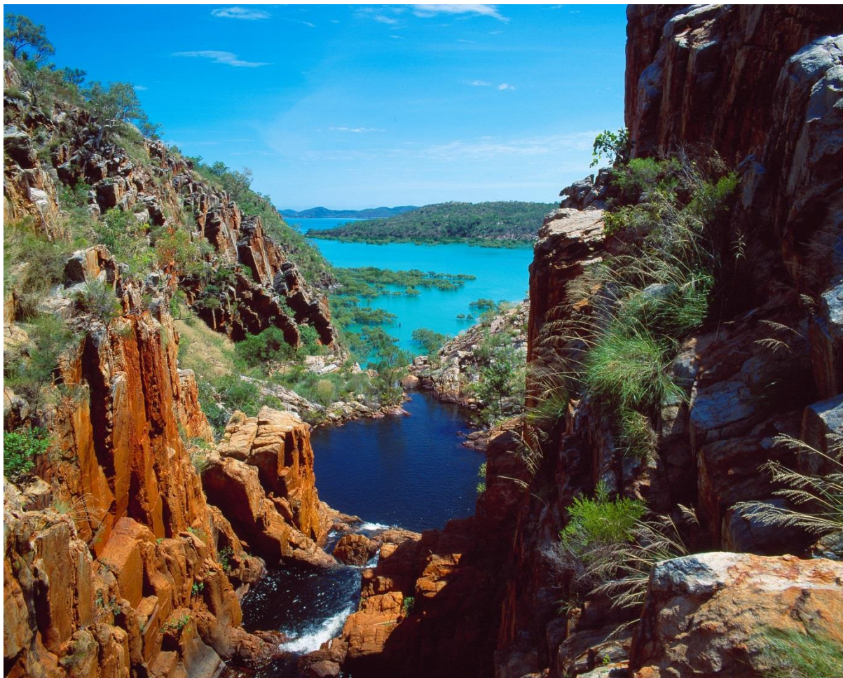
Waterfall, West Talbot Bay, Photo by Kimberley Media