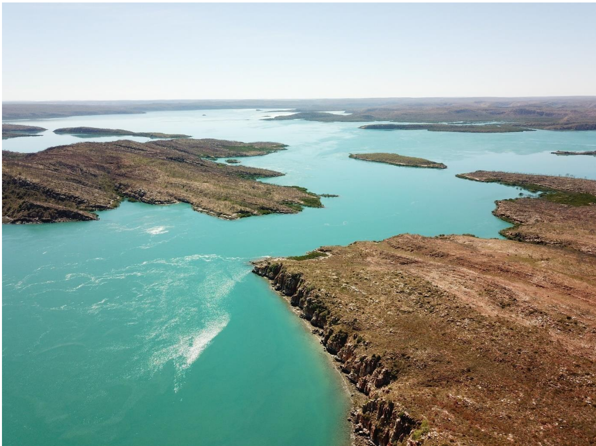
Lachlan Island.

Prepared by the Aboriginal Engagement, Planning and Lands Branch Department of Biodiversity, Conservation and Attractions