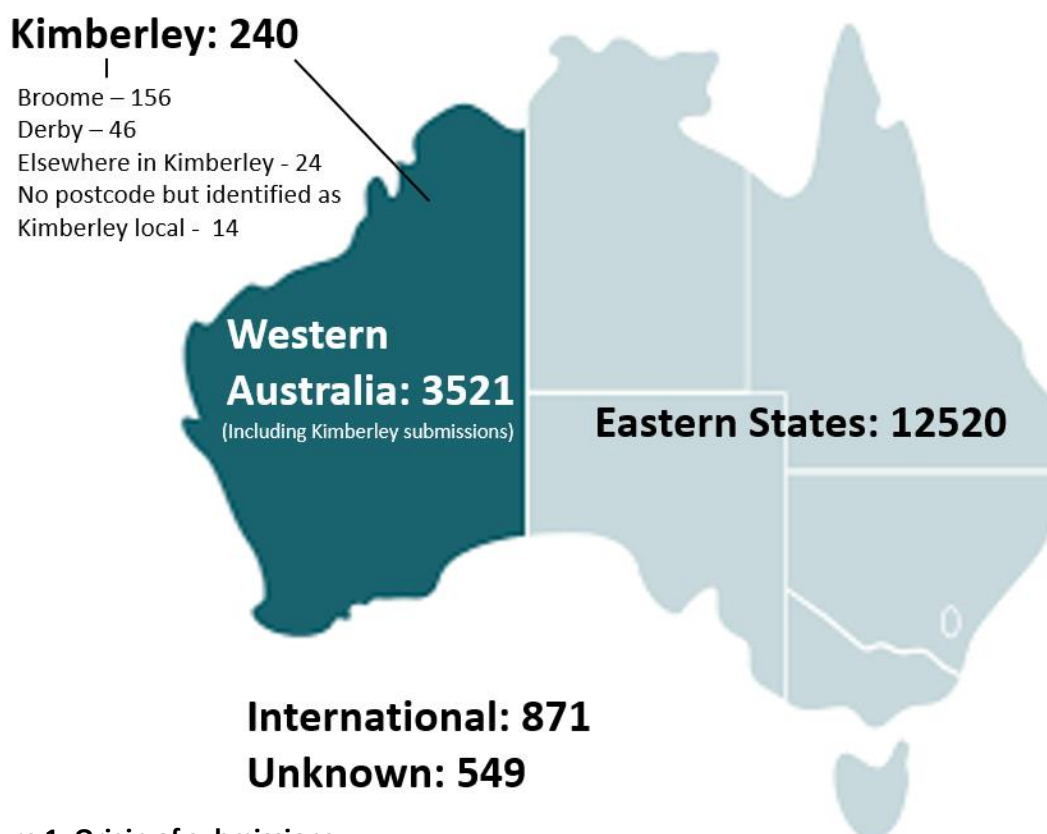
Figure 1: Origin of submissions

There were 871 submissions received from international postcodes; 12520 submissions were received from Australian states or territories other than Western Australia (WA); and 3513 were received from WA. Of the 3513 submissions from WA, 240 were from the Kimberley. Of the 240 submissions from the Kimberley, 136 were received via CNGOs. Of the 240 people from the Kimberley 46 were from Derby, 156 were from Broome, 24 were from other areas in the Kimberley and 14 did not provide a postcode but identified themselves as a Kimberley local. There were 549 submissions that did not specify a location. Fig 1 and Table 3 shows the number and origin of the submissions.