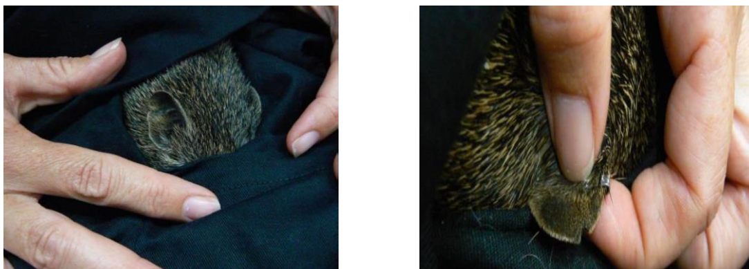
Figure 2 A quenda positioned ready for ear notching (left) and after its ear has been notched (right).