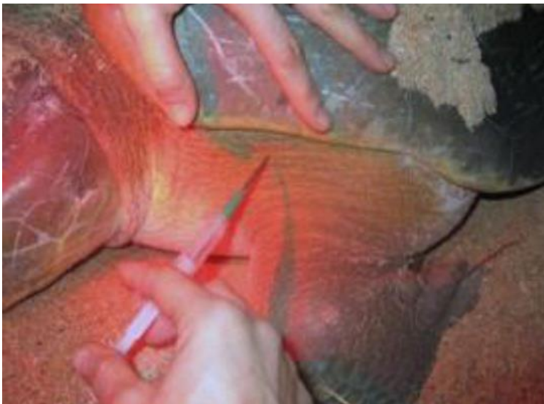
Figure 4 Inserting the PIT tag. Steady yourself and insert the needle in a smooth and confident motion, angling it away from the head. Do not move the needle inside the body. Remove it immediately after depressing the plunger maintaining the same angle at all times.

ANIMAL WELFARE: The needle should be inserted and withdrawn at a horizontal angle away