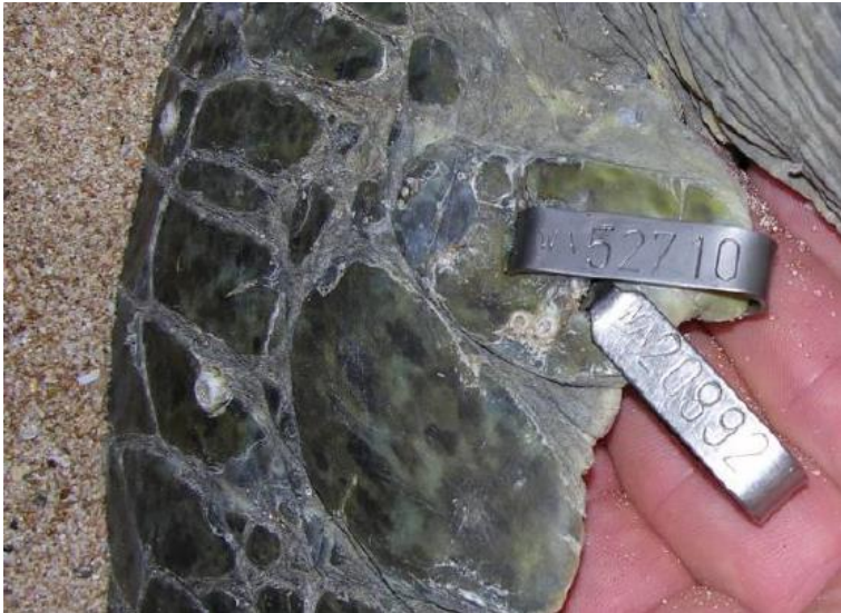
Figure 5 Green turtle flipper showing a new tag inserted in the centre scale, because the old tag is growing out with the scale.