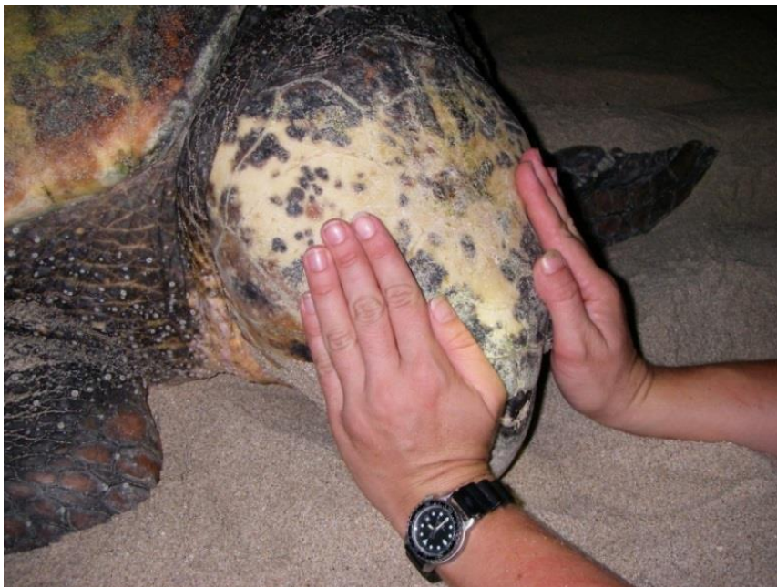
Figure 2 An example of restraining a loggerhead turtle. Note that the turtle is being restrained from the front, the nostrils are clear, and the handler's fingers are pointing up and away from the turtle's mouth.

If restraint is necessary, do so as instructed by the team leader since the method can vary depending on the circumstances. Restrain the turtle by covering its eyes, making sure that its nostrils are exposed, so that it can breathe, and so as to minimise discomfort. Restrain by facing the turtle, pushing the head back into the carapace and downward, applying only enough pressure to stop the forward movement of the turtle. Fingers must be kept pointing upward, away from the turtle's mouth (see Figure 2), as they can be bitten (or even severed) by the turtle.