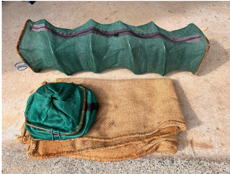
Figure 1 A double-ended funnel trap opened and folded up for transportation.

maintain shape when open and have a near full length zipper for removing captured fauna. Traps with shorter zippers can make animal extraction difficult.