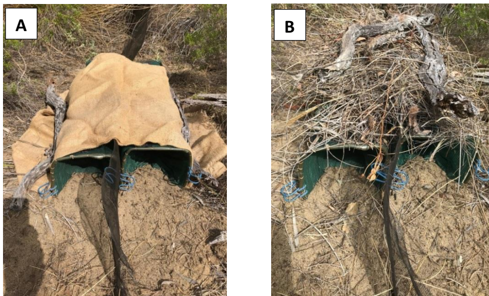
Figure 3 (A) Two funnel traps sit flush with the drift fence and covered with thick hessian. (B) Two funnel traps with additional vegetation cover.

Traps must not be deployed at a site during any period of flood risk.